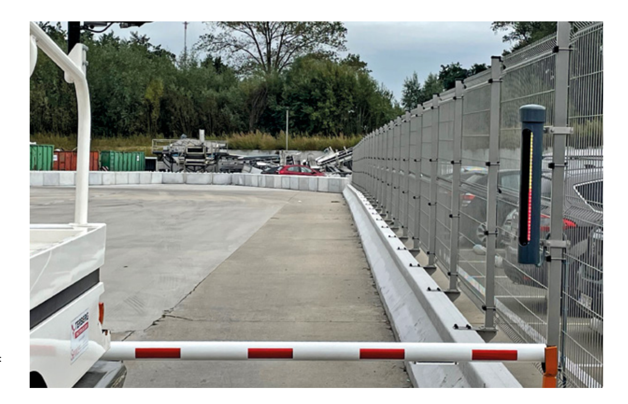
The light points on the WLS27 LED strip visualize a timer that counts down the driver's waiting time