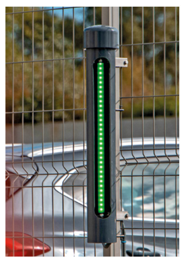
The WLS27 LED strip is waterproof and clearly visible even in daylight, making it perfect for outdoor use

The limited maneuvering space in the Ardo truck parking area requires smart access control