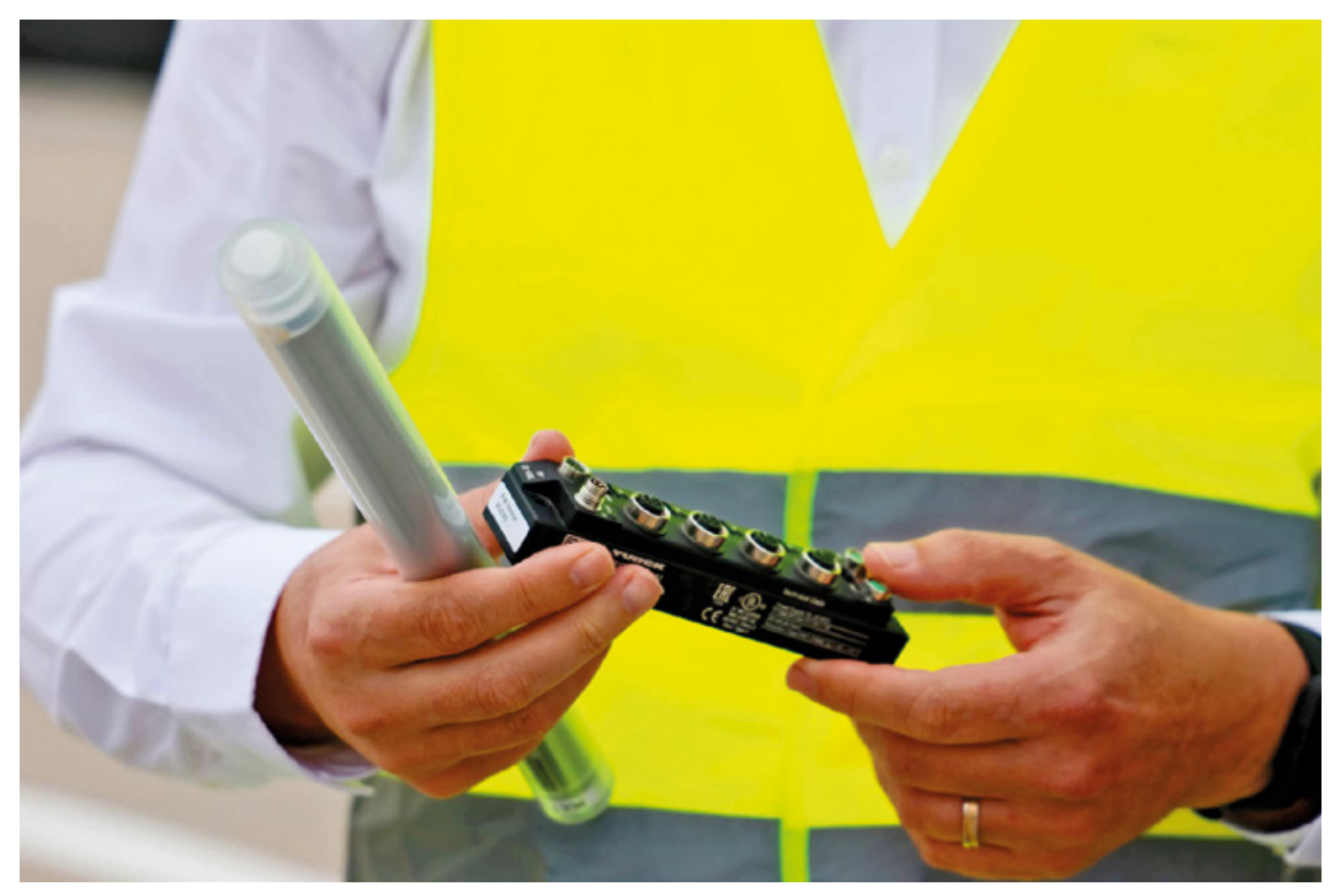
The TBEN-S2-4IOL multiprotocol I/O module is the heart of the traffic control system

Thanks to its unbreakable, waterproof and UV-resistant copolyester casing with IP69K protection, it is perfect for outdoor use. At the barrier, it uses different colors and flashing patterns to show truck drivers when they can enter, regardless of their spoken language. The clear visual signal prevents collisions and ensures a smooth flow of traffic while improving safety for people, vehicles and infrastructure.